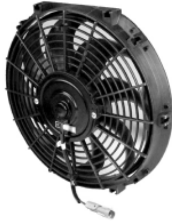
11.00" Pusher Fan