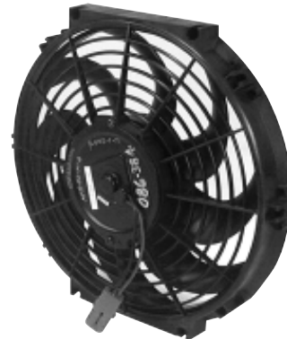
2000 and Later Workhorse RV Chasis with Dual Fans