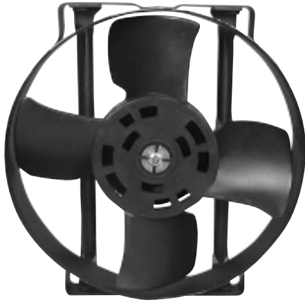
10" Fan with skirt